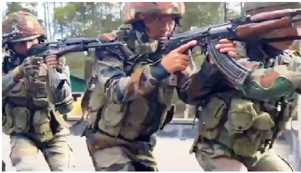
Screengrab of “Kazind-22” from video tweeted by the Indian Army.

This joint exercise will enable the two armies to train,